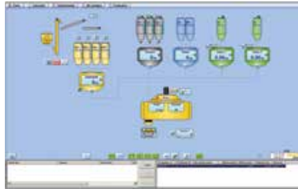
SKAKOMAT 600 S